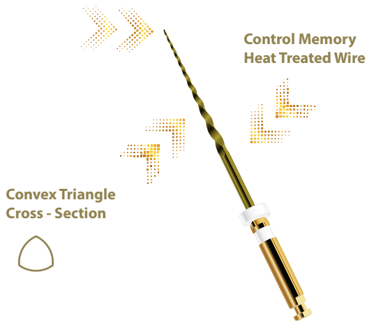
EndoArt Ni-Ti Gold-Blue Reciprocal Root Canal Files