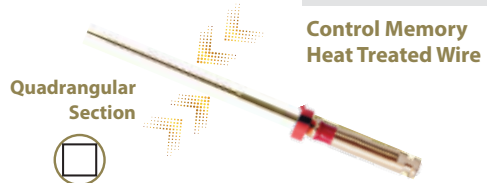
EndoArt Ni-Ti Path Rotary File